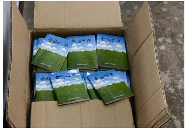
(John’s Gospel Ready for Distribution)

The Lord has shown us over and over again that if we’ll pray risky prayers and commit ourselves to follow the unique Gospel vision He lays on our hearts that He will more than exceed our wildest expectations. But it doesn’t just happen because we believe – it happens because YOU answer the call and the Lord Himself puts the resources in your hands to be generous in His name . And that is exactly how we are praying for you . Personally, I’m praying that God will bless you in even more wonderful ways as a result of your faith and generosity. May He be extraordinarily generous to you as well as through you .