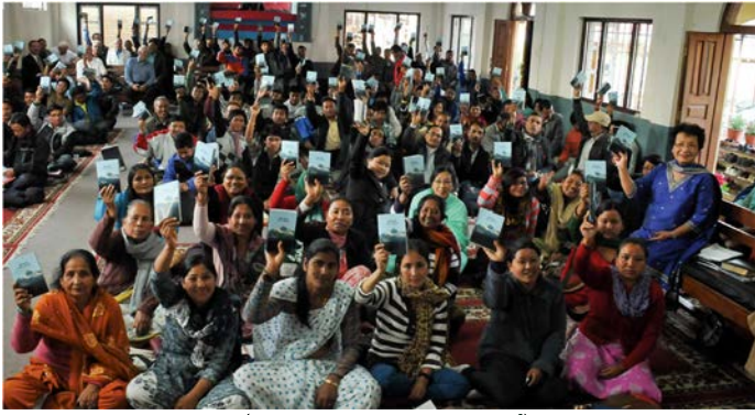
(New Testaments - Nepal)

Western China - in places where the Gospel has never been heard before! And we know from experience that each copy of the Word of God gets shared over and over again. Often as much as 5 times before they are worn out. That means our faith goal could reach up to One Million People .