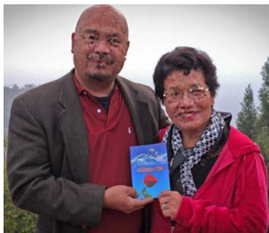
(Our Partners in India)

First, I want to re-introduce you to a dear Compassion Radio friend and ministry partner this month. His name is [REDACTED] and he's the latest in a line of powerful, apostolic missionary visionaries we are so honored to know, personally. "[REDACTED]" is the amazing ministry he leads, and it is one of the premier Bible