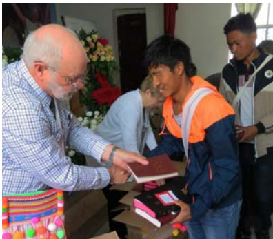
Bible Distribution - China

Friends, I know that this is a big goal , but I know one thing which gives me great confidence – you’ve done it before . When we have communicated similar-sized