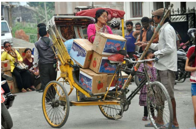
(Delivering Bibles - Nepal)

What these 2018 adjustments mean to you and to our monthly ministry partners is this: Our overhead is lower than it has ever been, and that means we can grow into an even more effective Kingdom-building ministry. We look to you to build our 'Vision Team' monthly givers to keep us on the air, and online, so that all of our projects can continue, and increase. Those sustaining monthly gifts are absolutely essential to get us to the fulfillment of our new vision for Partner Projects.